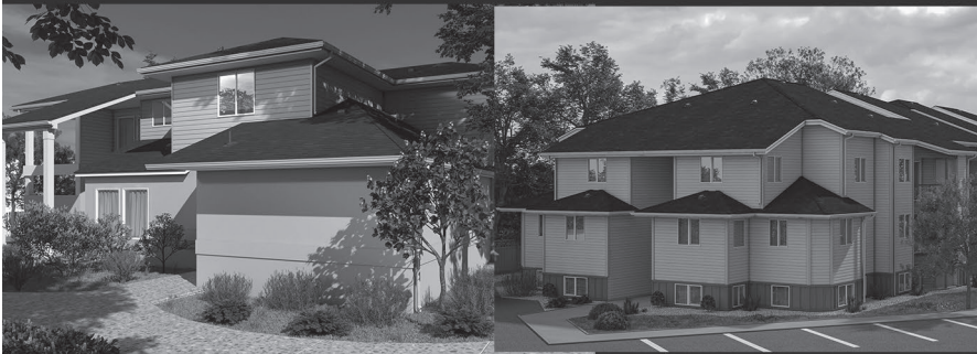
*HD Renderings for previous multi-family customers

Roofing | Siding | Windows | Doors | Painting